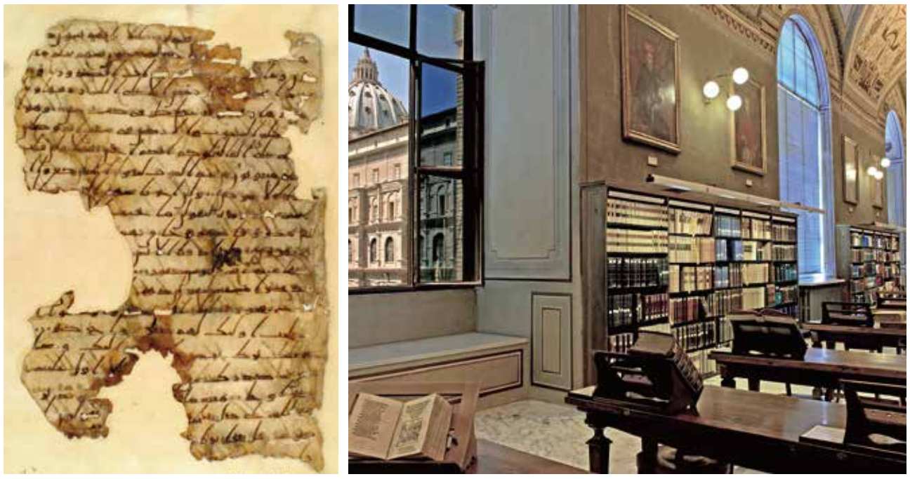
A Kufic Qur'an

Since 2014, NTT Data has been involved in digitally archiving these historical artifacts for posterity. These rare documents are humanity's treasures, and by creating a digital archive that can be browsed by anyone, we are applying ICT to contribute to a solution that will benefit the children of the future.