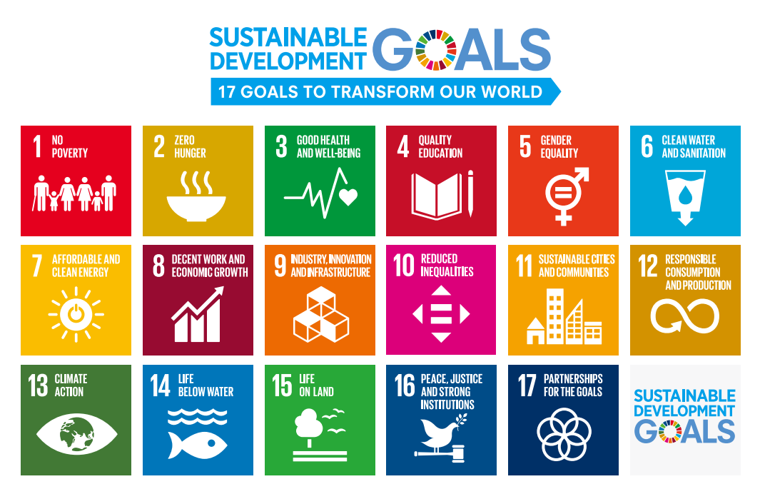
Sustainable Development Goals (SDGs): The goals were incorporated into the 2030 Agenda for Sustainable Development adopted by the leaders of over 150 UN member nations at the UN Sustainable Development Summit in September 2015, and came into effect in January 2016. They comprise 17 goals and 169 targets based on the Millennium Development Goals (MDGs). To realize sustainable development, each member country should aim to achieve various goals by 2030, including eradicating poverty and hunger, responding to energy and climate issues, and pursuing a peaceful society.

We hope to continue building our momentum toward achieving the SDGs through a variety of initiatives. We will do our best to do so not only through the use of our own products and services, but also through collaboration with partners on technologies and knowledge.