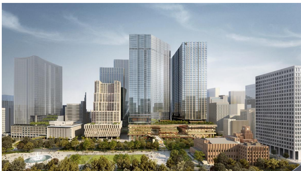
Artist's rendering of “HIBIYA CROSSPARK”

The developers of the urban redevelopment project underway in Hibiya, Tokyo, have chosen an official name for the upcoming mixed-use district “HIBIYA CROSSPARK”. They have also created a logo and brand concept: “A place where all paths cross.” A website and brand concept movie will accompany the name launch.